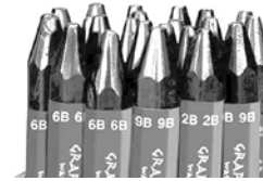
Introduce Graphite sticks